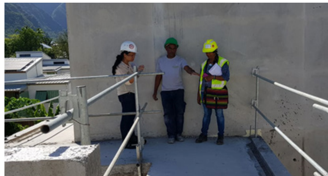
Inspection visit carried out in pairs, Réunion Island, February 2019

sanctions), were of particular interest to Malagasy colleagues.