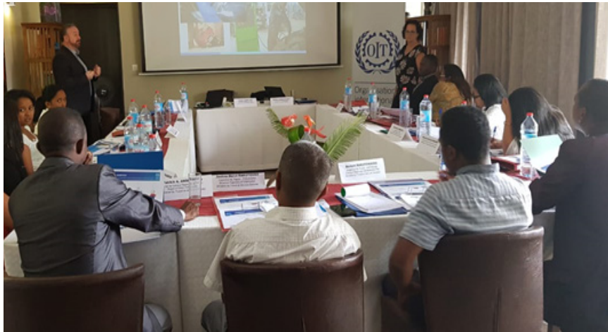
Task Force Training, Antananarivo, November 2018

In the framework of ILO's Flagship Programme on Occupational Safety and Health, Madagascar receives funding from the French Ministry of Labour through the Vision Zero Fund (VZF) to prevent injuries, accidents and occupational diseases in Malagasy economic sectors integrated into the global textile and lychee supply chains.