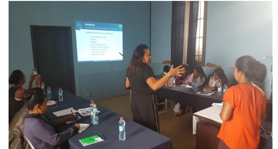
Training activity led by the Task Force, Madagascar, February 2019

To identify partners of the Labour Inspectorate, in particular social security institutions and occupational health services